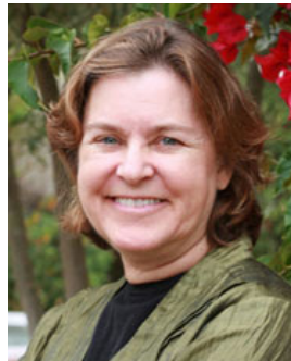
Karen Joy Fowler

The English Department's annual Richard W. Gunn Memorial Lecture will feature author Karen Joy Fowler on Tuesday, 14 March, at 7:00 pm, in the Jayhawk Room of the Kansas Union. See next week's issue for details.